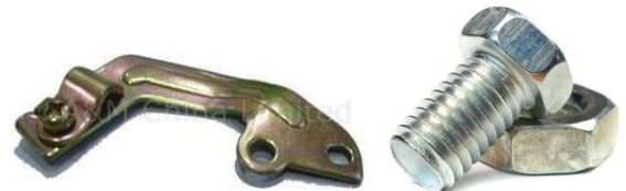
FASTNERS – BOLTS & NUTS